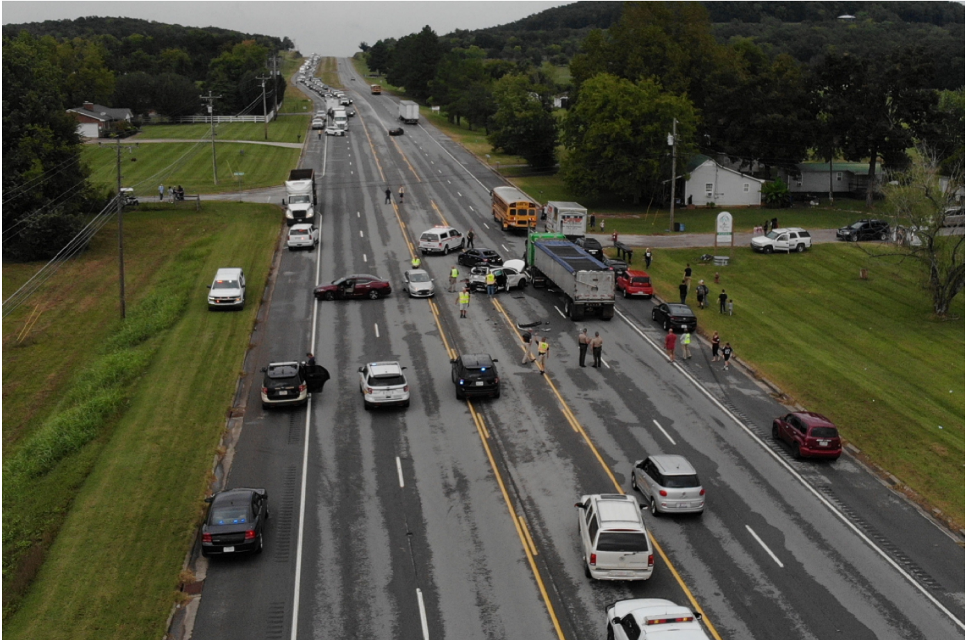
A THP drone shot of the scene of crash

is still teaching (now relocated to Spokane, WA) but she reports, (1) PTSD, (2) anxiety when driving, (3) intermittent headaches, and (3) she can no longer enjoy hiking as her foot will swell.