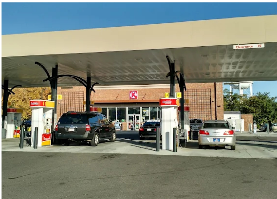
Circle K Store 1528 on N. Main Street in Summerville, SC

LaToya Scott, then age 32, was a patron on 10-7-17 at a Circle K convenience store (No. 1528 on N. Main Street in Summerville) and she was getting gas at Pump No. 9. It's a busy store near I-26 and is open 24 hours a day. Scott had parked her 2015 Honda Accord sedan and left the door open as she pumped the gas. Her daughter (Zacora, age 11 at the time) was a front seat passenger.